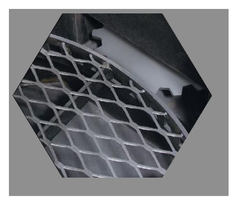
Sprocket Driven Turntable