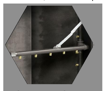
Swing-Down Spray Bar