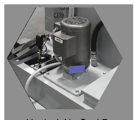
Vertical, No-Seal Pump