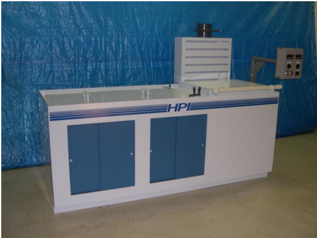
HPI Processes Polypropylene Fabricated De-Oxidation Process System for Surgical Implant Components.

Call us today for the solution to your fabrication requirements. 1-888-733-2832