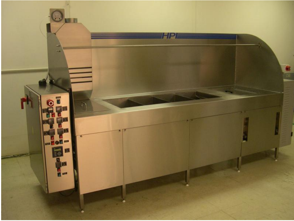
HPI Processes Stainless Steel Fabricated Passivation Process System for Surgical Implant Components.

HPI Processes, Inc. 1030 Revenue Dr. Telford, PA 18969 Phone 888-733-2832 Fax 215-799-0459