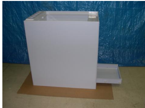
All CNC Router Cut, Thermo-Welded, Polypropylene Fabricated Wet Process Cabinet.