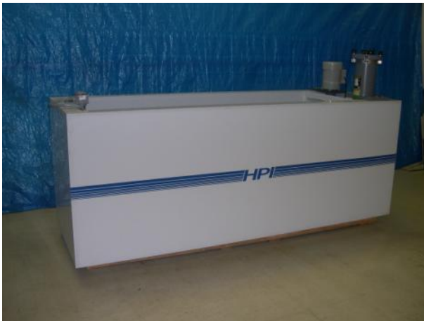
All Thermo-Welded, Polypropylene Fabricated, Steel Girth Reinforced, Double-Containment Plating Tank.