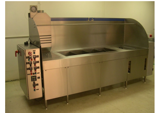
Stainless Steel fabricates Passivation Process System for Surgical Implant Components