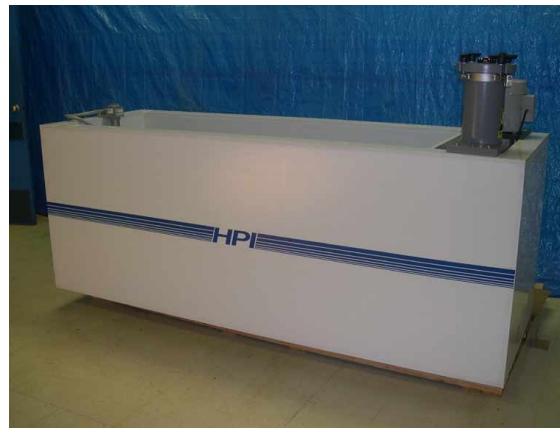
All Thermo-welded, Polypropylene Fabricated, Steel Girth Reinforced, Double-Containment Plating Tank